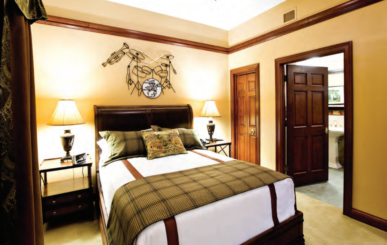
Sam Snead Cottage | Cottage B