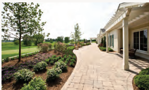
Harvest Lodge | Outdoor View