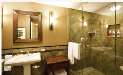
Harvest Lodge | Indoor Amenities