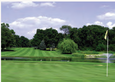
Hole #6 Gold | Lake Katherine Par 4 | 490 Yards

Consistently ranked in Golf Digest's America's 100 Greatest Golf Courses, Rich Harvest Farms consists of 18 pins, 45 potential hole combinations, and immaculate grounds keeping. The course is an experience all its own and the staff consistently provide world class service and amenities experienced by few.