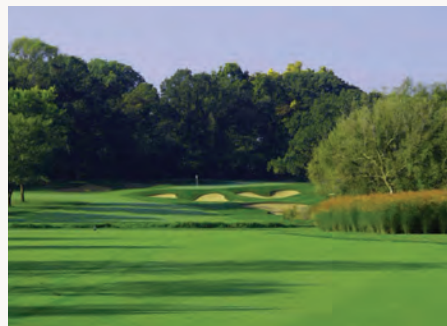
Hole #9 Silver | The Road Hole Par 4 | 443 Yards